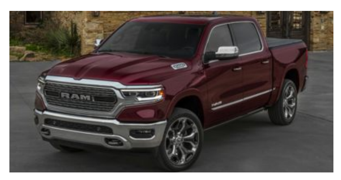
Note:Photo may not represent exact vehicle or selected equipment.

Vehicle: [Fleet] 2021 Ram 1500 (DT6L91) Tradesman 4x4 Crew Cab 6'4" Box ( ✓ Complete )